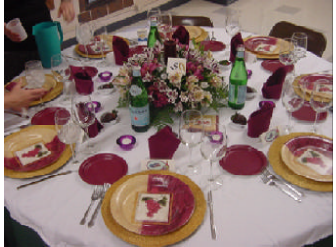
Sisterhood/Brotherhood wine tasting, June 7. This is the prize-winning table for superb decoration, created by Rochelle Bekerman.